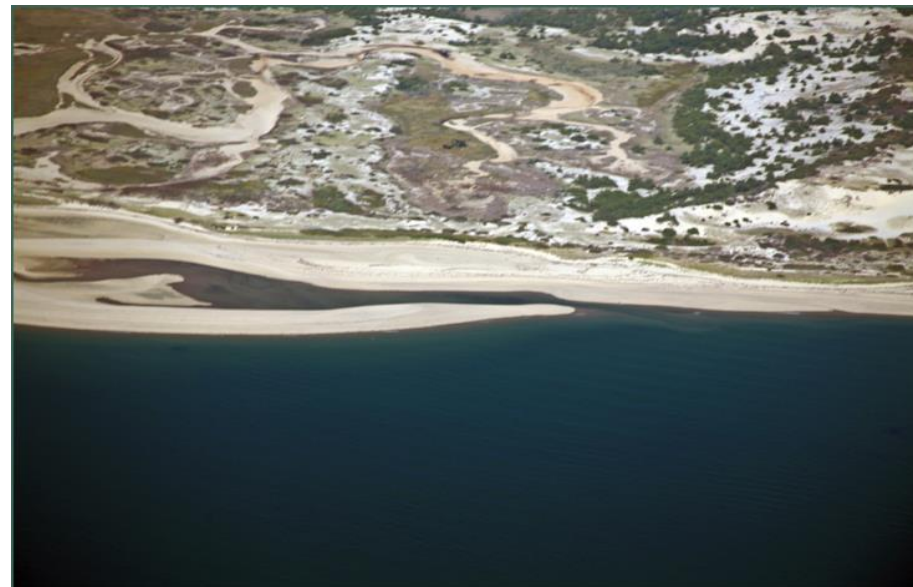
Hatches Harbor looking northeast