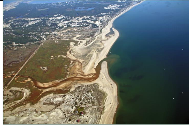
Hatches Harbor looking southeast