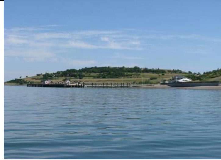
Dock on the Southwestern shore of Spectacle Island