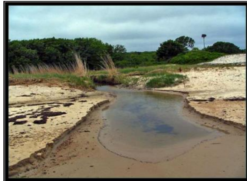
Tarpaulin Cove western channel looking northwest at low tide 13 Jun 2007.