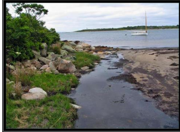
Tarpaulin Cove eastern channel looking southwest at low tide on 13 Jun 2007.