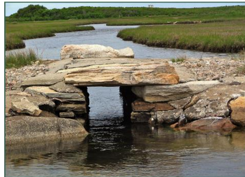
Timmy Point Road (site of CB-02) looking northwest at high tide on 13 Jun 2007.