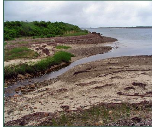
Uncatena Marsh Creek looking east on 8 Jun 2006.