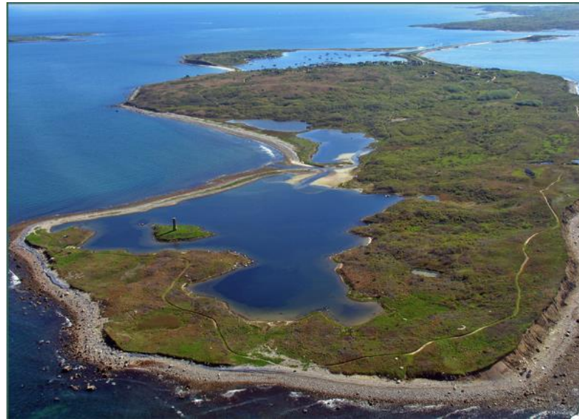
View of pond looking east at low tide on 29 May 2004.