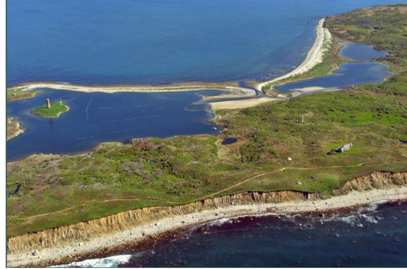
View of pond looking north at low tide on 29 May 2004.