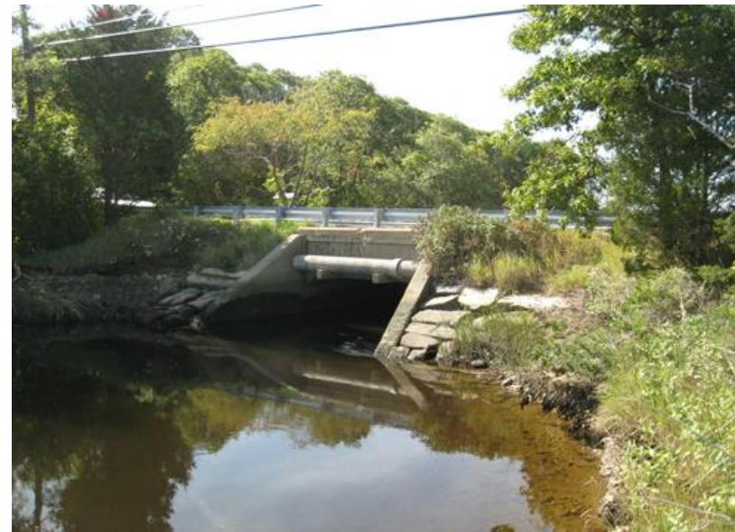
Culvert located along Gannett Rd looking West. Site of CB-01