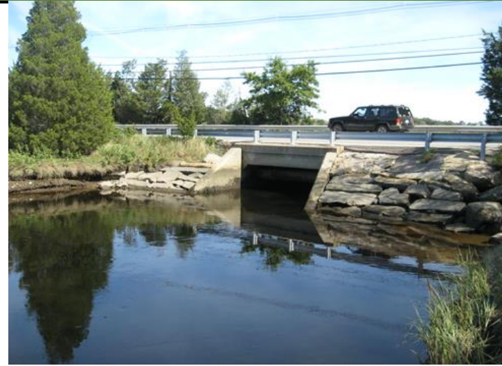
Culvert located along Gannett Rd looking east. Site of CB-01