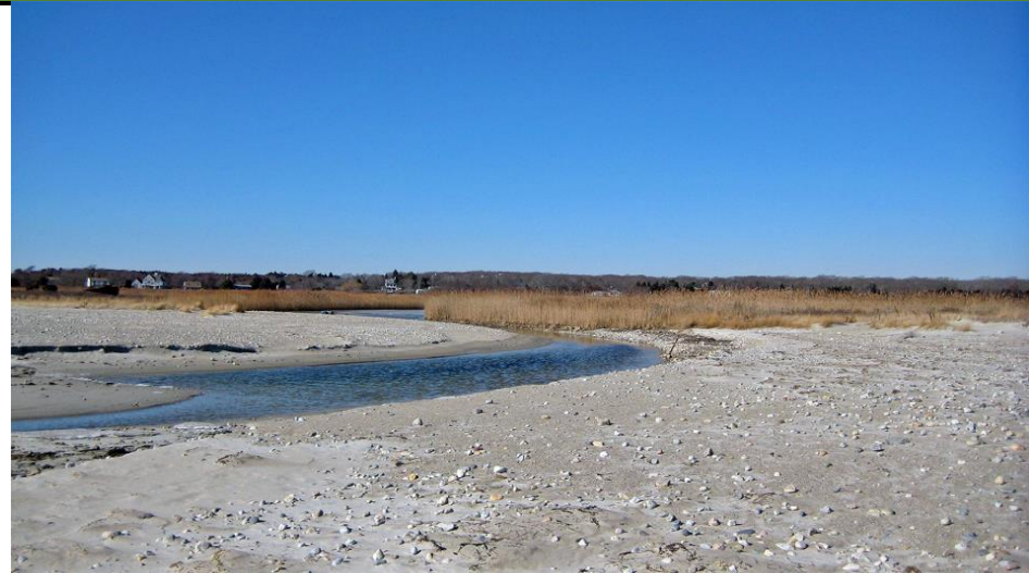
Richmond Pond entrance looking north on 23 January 2008

Town of Westport Shellfish Constable (508) 636-1105 Westport Fire Department (508) 672-0721 The Coalition for Buzzards Bay (508) 999-6363