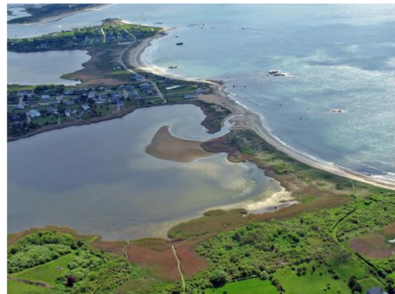
Aerial view looking east at low tide on 29 May 2004.