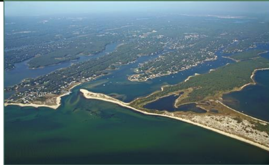
Waquoit System looking northwest