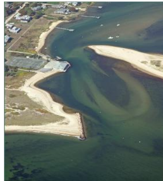
Eel Pond Entrance looking north