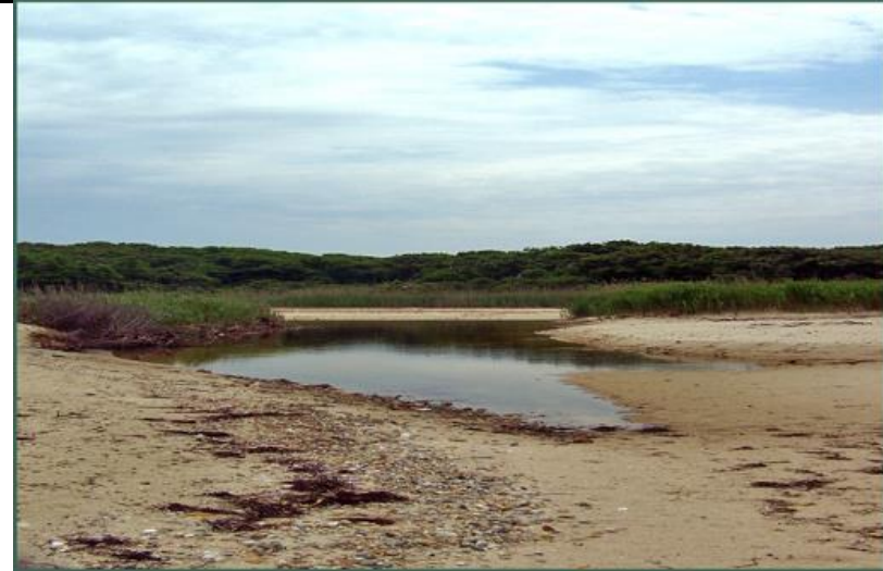
Flume Pond entrance looking east at low tide on 28 Jun 2008.