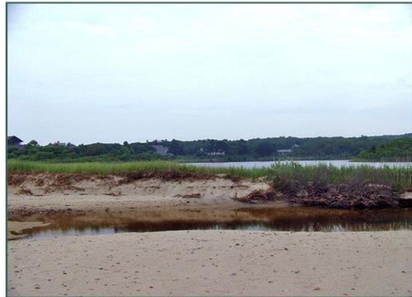
Flume Pond entrance looking northeast at low tide on 28 Jun 2008.