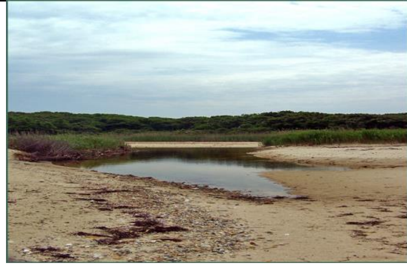
Flume Pond entrance looking east at low tide on 28 Jun 2008.

Environmental Affairs Coordinator (508) 910-1822 Harbor Master (508) 999-0759 Massachusetts Department of Fish and Wildlife (508) 792-7270 The Coalition for Buzzards Bay (508) 999-6363