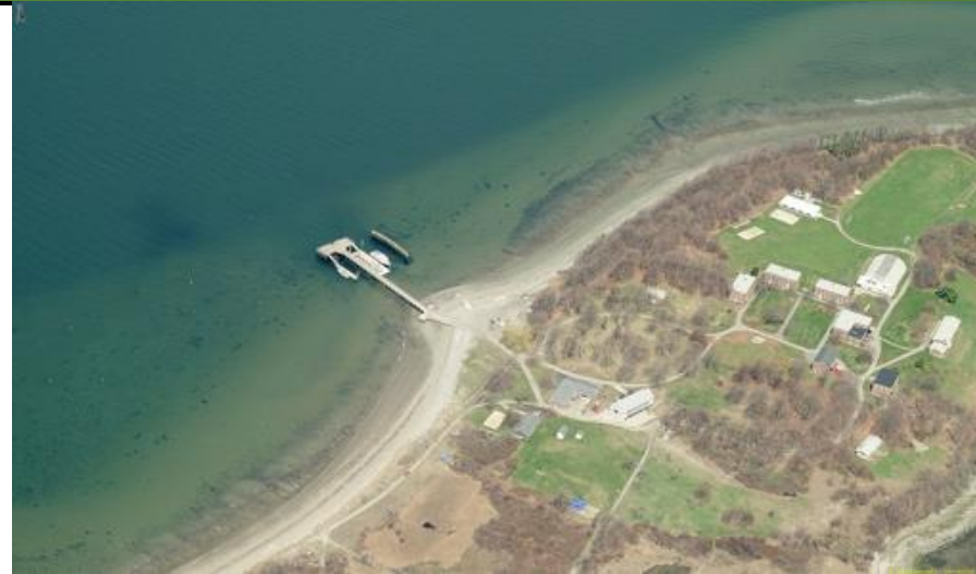
Dock (site access) on NW side of island