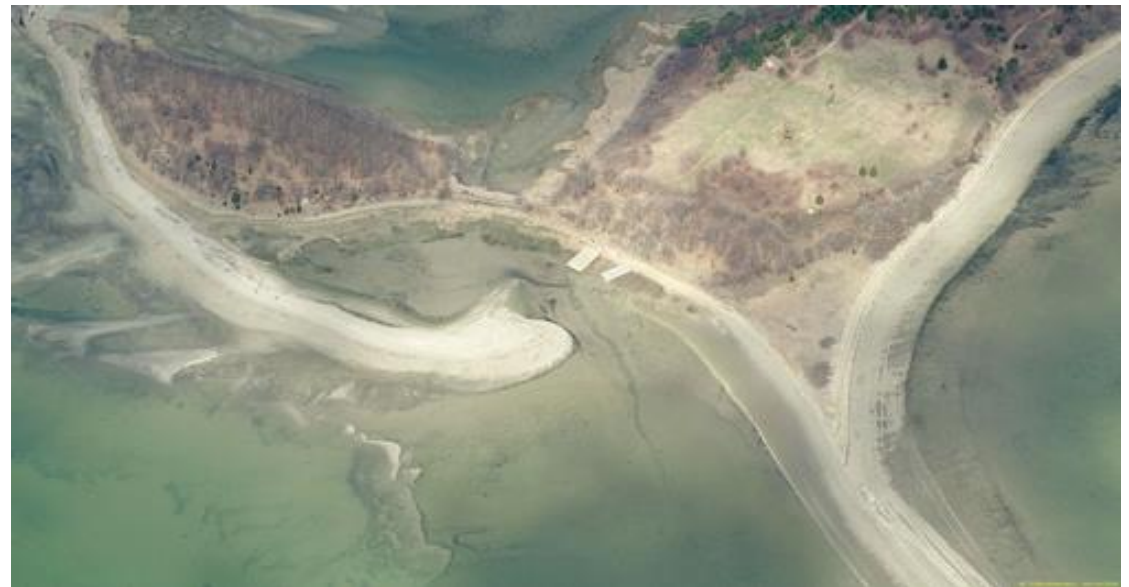
Entrance to marsh at EX-01