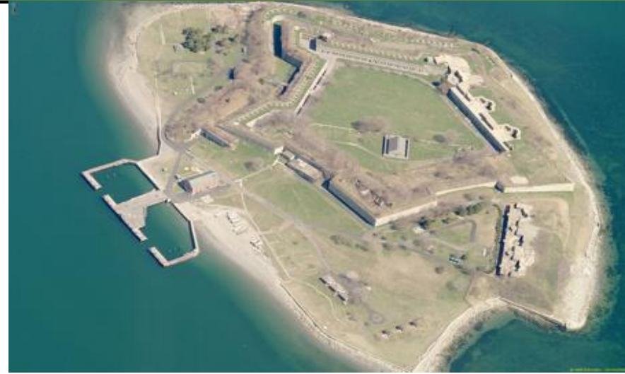
Staging area on Georges Island