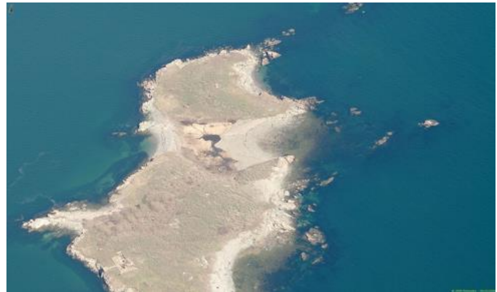
Site of BB-01 interior marsh on Calf Island