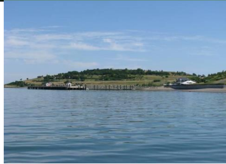
Dock on the Southwestern shore of Spectacle Island