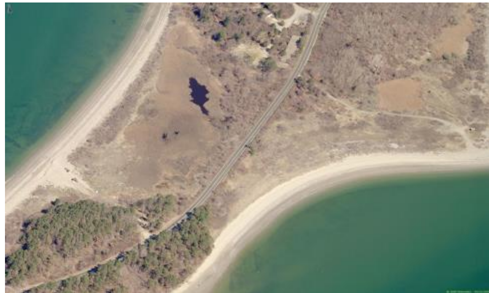
Interior marsh located on Long Island